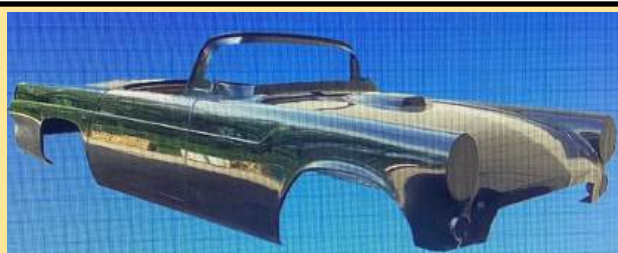
1955 1956 1957 Thunderbird Body Fiberglass REGAL T-BIRD Replica $13,995.00

While looking/researching multiple articles about 55-57 Ford T-Bird restoration, we kept finding references to complete body kits that have been available since the mid- 1980's. Regal Roadsters, LTD. based in Madison, WI have offered these fiberglass T-Bird bodies since 1985/86 and continue to sell them today. Their replica fiberglass bodies are considered top quality and do look just like the steel original body. It is estimated that with the combined fiberglass replicas bodies offered by Regal Roadsters, Dofral Industries (Turn-key car) and Shay company, there may be well over 250 such T-Birds on the road and or being built. They are more so popular in the eastern part of the United