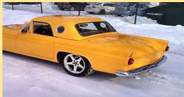
Completed fiberglass T-Bird 56'

States and Canada simply because those who want to drive a T-Bird year round but, do not want to deal with road salt corrosion and a rusting body prefer the fiberglass bodies. The price tag for a Fiberglass body ranges from $4,500 used to $14,000 plus new.