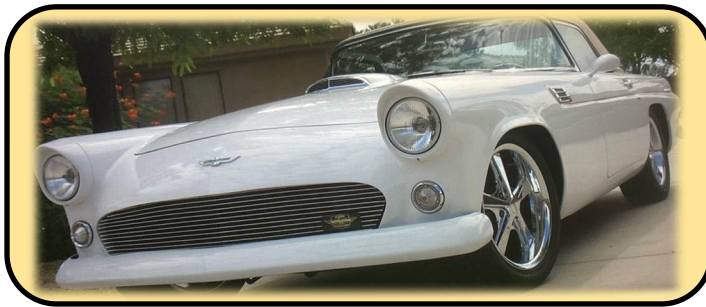
The 1956 "Angry Bird" Circa 2023

This short list of these other T-bird components recreated in fiberglass is as follows: Side Tire Skirts, Hood, Different/modified Front Bumpers and Rear Bumpers and Hardtops to name some.