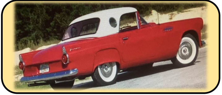
The 1955 "Ritche Brandl Fiberglass T-Bird Replica

This article below says it all about the true classic car enthusiast who wants to drive a classic with modifications but does not want to step too far from the original design.