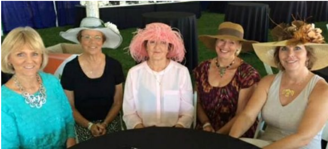
Club members enjoying Polo match