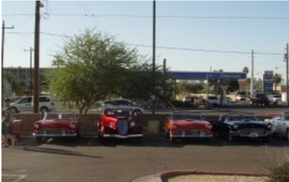
Remember the raty old 34 that won all the shows!