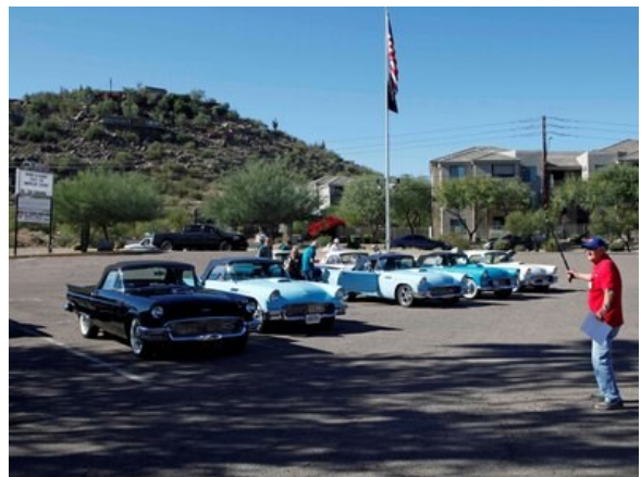
Lots of cars at American Legion Post