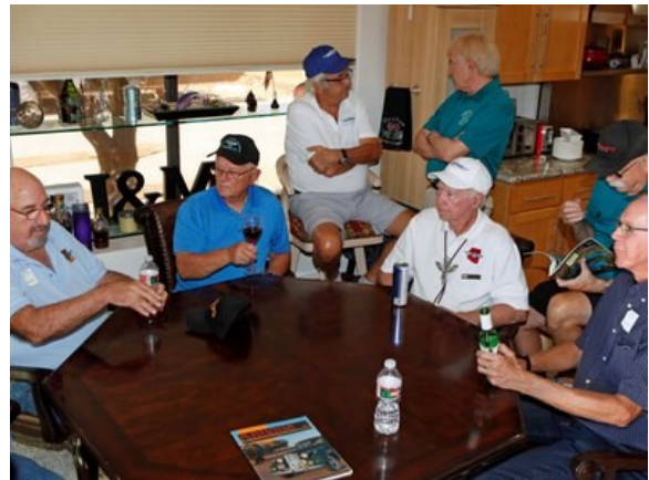
Big card game at La Caille