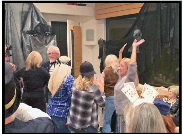
Dinner with Albuquerque Club on way to Knoxville