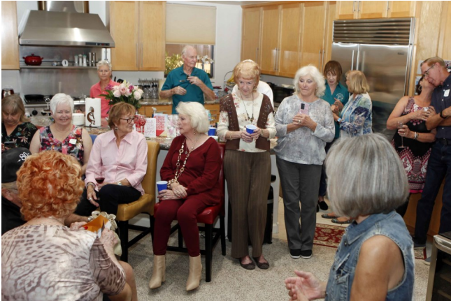
Brain Power at Work

Memories from days gone by Must be party time