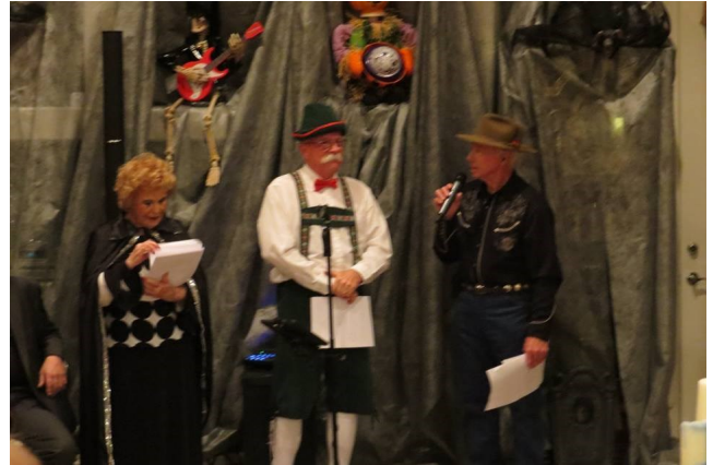
New Years 2018