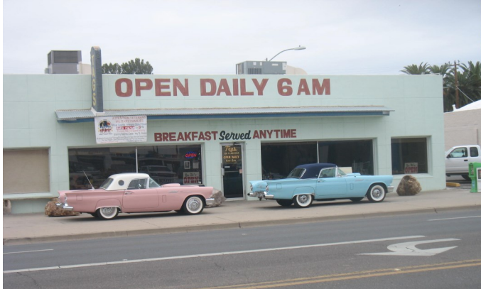
Lunch stop on our way to Oro Valley