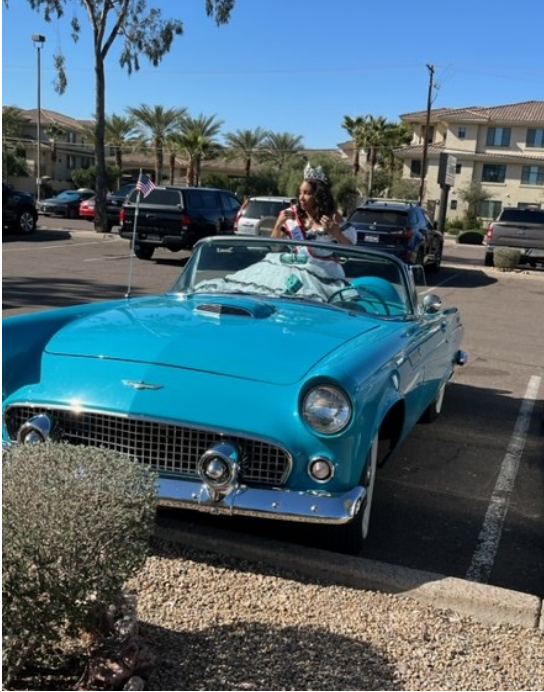
Yvonne at Parada Sol Parade